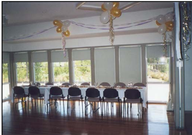
A previous wedding reception.

All prices are subject to change and include GST where appropriate.