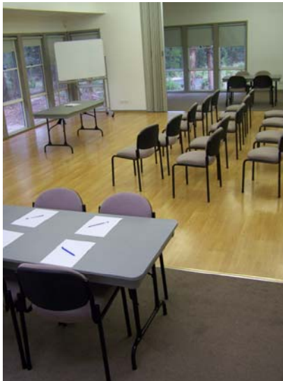
Meeting room 2 is flanked by smaller rooms 1 and 3 to either side.

A non-refundable deposit of $55 is required when booking the venue and must be submitted with your hire agreement form as soon as you have selected a date/s. The balance of the hiring fee, plus insurance and bond are payable prior to the booked date.