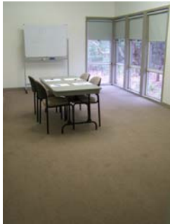
Rooms 1 and 3 are suitable for meetings of up to 12 people.

A range of rooms are available for hire which can accommodate your guests in various configurations. Rooms 1, 2 and 3 can be used separately or join to form larger spaces as required.