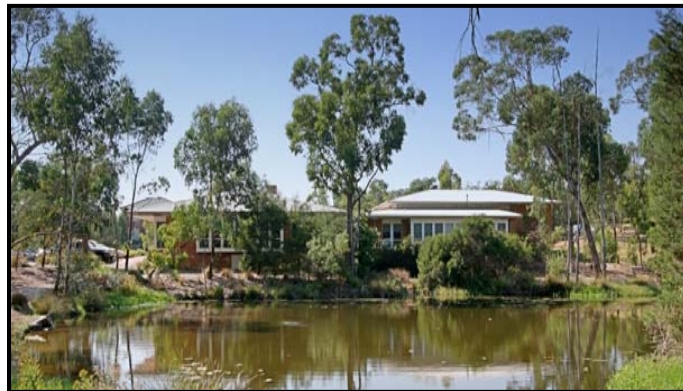
Our meeting rooms overlook the lake in Yarrunga Reserve.

76 - 86 Croydon Hills Drive Croydon Hills 3136 Melway Map 36 G9