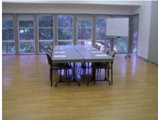
Room 2 is an ideal seminar room or large meeting space.